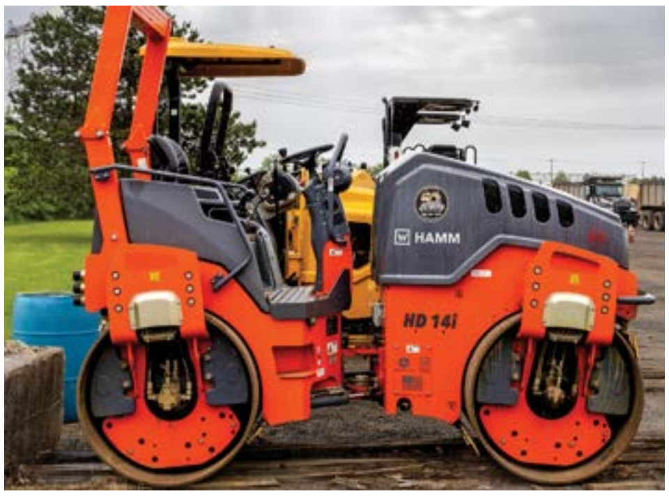
Hamm asphalt roller

acquired for permanent placement in the fleet. The Komatsu Loader, one of the Hamm Rollers and a Caterpillar Excavator – will be stationed at the New York Training Center. The rest of the machines are currently in Dayton.