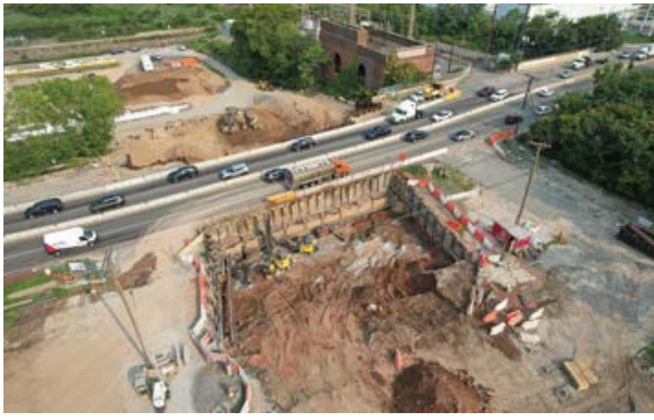
The eastern side of the Tonnelle Avenue site.

Once finished, the Portal North Bridge will play a critical role in the larger Gateway Pro-