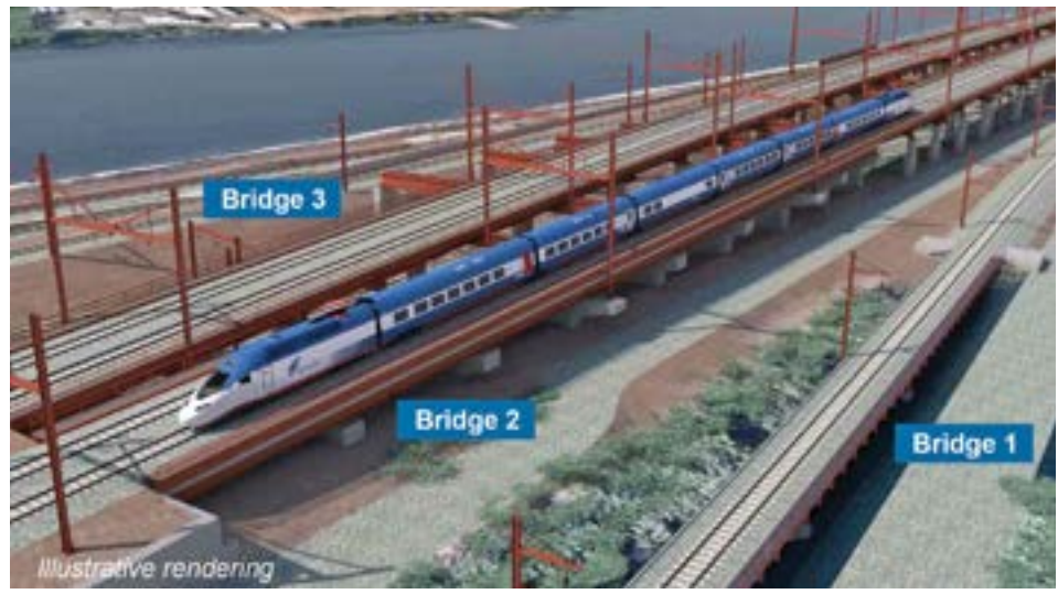
Digital rendering of the Sawtooth bridge once completed