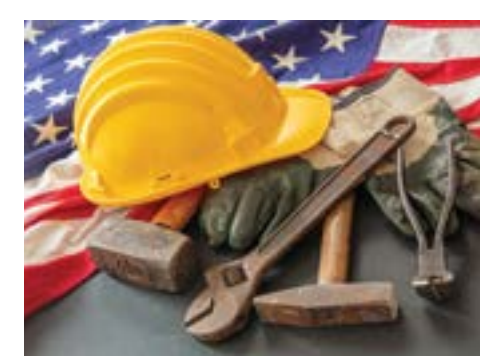
Apprentices Take Labor History Class