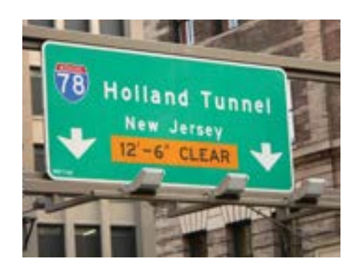
NJ Turnpike Expansion

neering work are now in progress, with construction expected to begin in 2026.