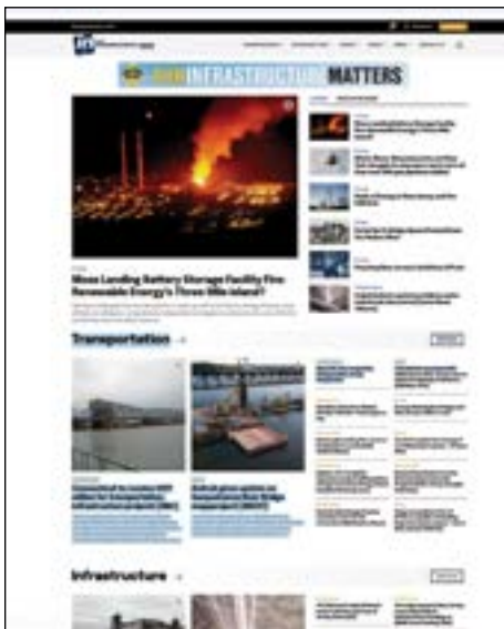
Online page of the new TINN