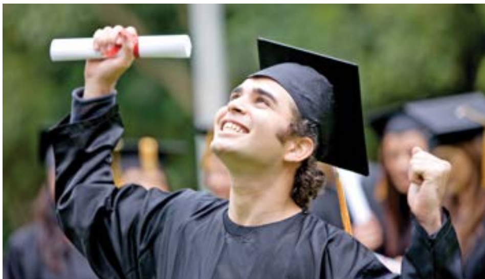
Scholarship apps now available

have different requirements and application deadlines. Don't miss these opportunities to help your child or grandchild meet the high cost of higher education.