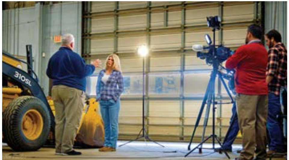
Recording original content for TINN use