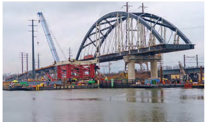
The arch is lowered into position and will be joined with two more arches.