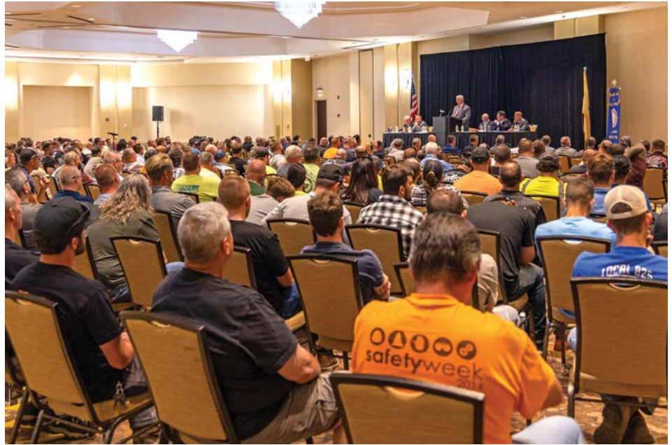
Members eager to return to active, in-person meetings.

"Since January, the organizers signed elev-