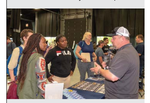
Although covid-19 interrupted the routine, Local 825 plans to resume outreach efforts as soon as it is permitted.

More information will be unveiled about these initiatives as they are developed.