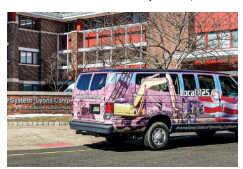
The Local 825 van arrives at the VA Lyons Campus location

The donations were divided between two veteran facilities: the Lyons Veterans Administration Hospital and Nursing Facility in Bernard's Township that also houses homeless veterans; and the Veterans Haven North, a transitional housing facility in Glen Gardner for homeless Veterans run by the Department