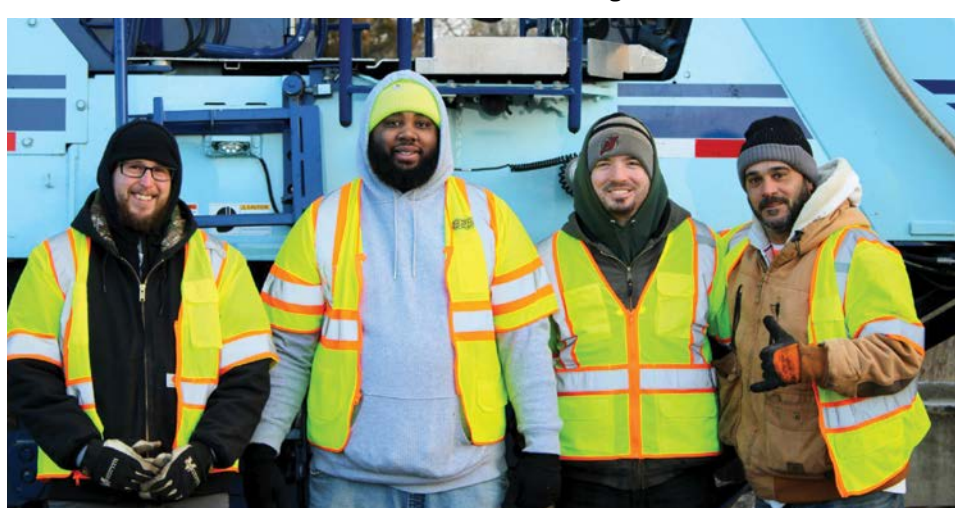
Local 825 is stepping up its programs to promote racial and gender equality

The bill is now on the governor's desk, awaiting his signature. As of press time, we are awaiting news of his decision.