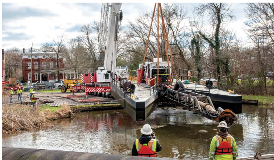
350-ton Bay Crane lifts 45,000-lb dredge from the canal.

Approximately 233,000 tons of sediment were removed over three years. The sediment was transported to the American Cyanamid site in Bridgewater and “detwatered.” Once dry enough, it will be stored there for beneficial reuse.