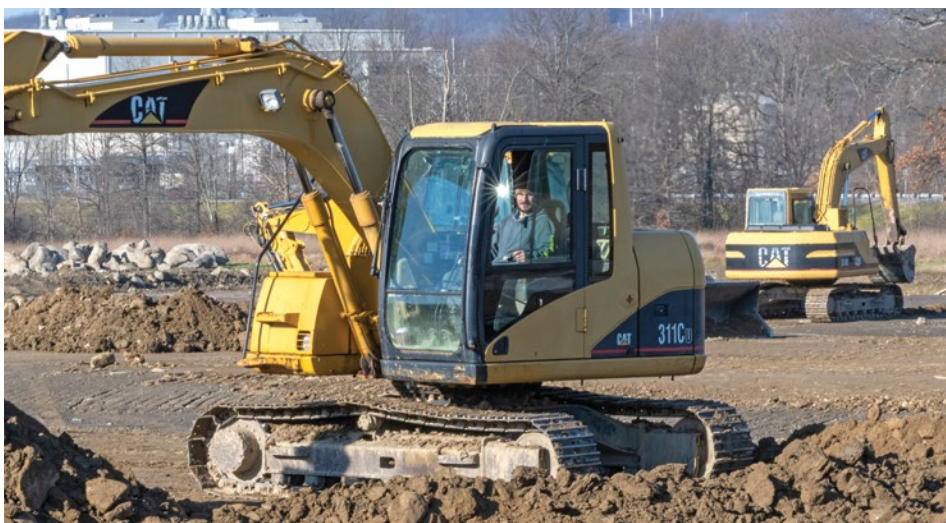
Apprentices and Journeymen hone their skills