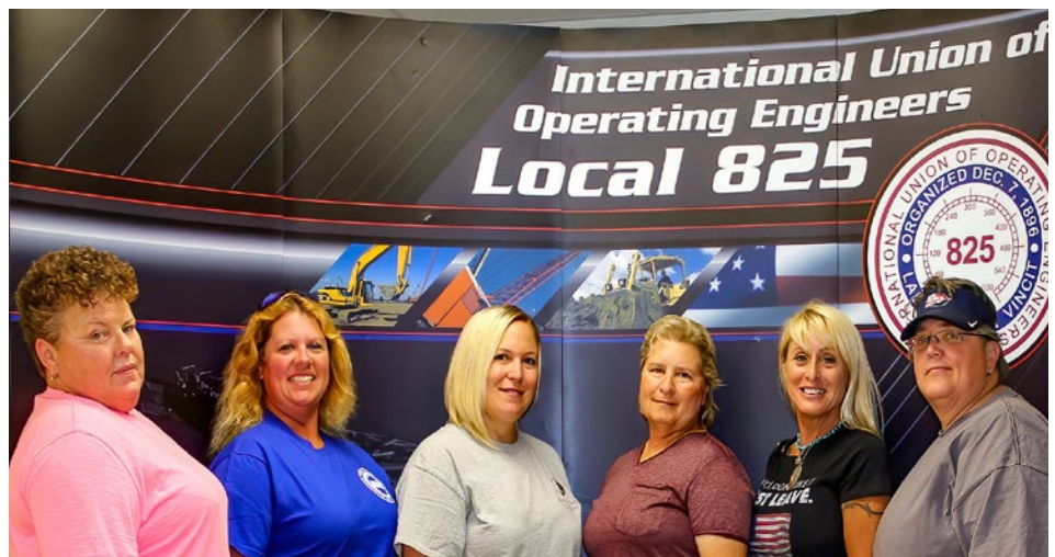
The Local 825 Women's Committee offers members a safe venue and forum for advice, direction and support for Local and worksite related issues.