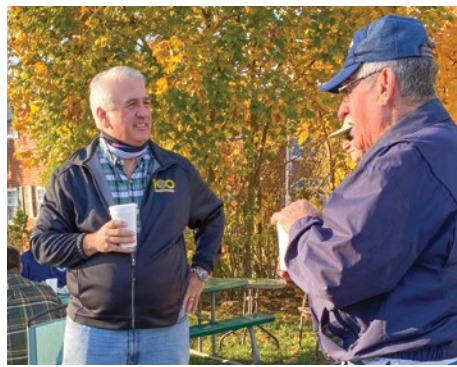
Toms River conversation