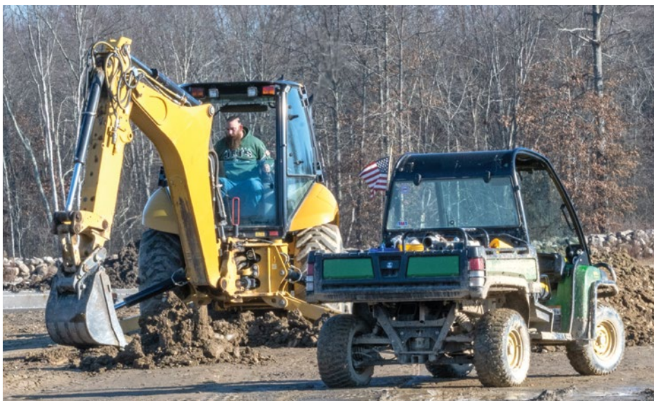
Members get a jump on winter classes