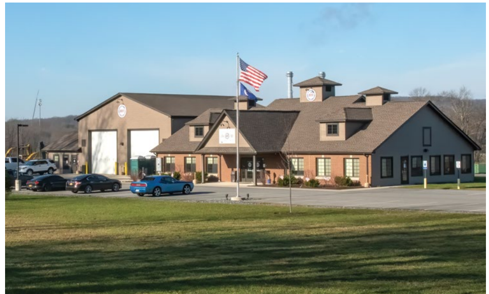
The New York Training Center in New Hampton