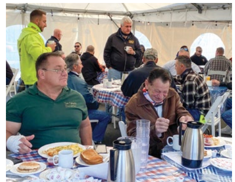
In Matawan, members met in outdoor tents