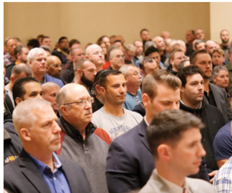
Nearly 500 members attended to hear the latest updates.

At the last Semiannual meeting members watched a video demonstrating a completely