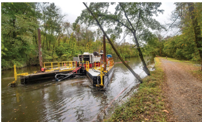
The old pathways that were once used by mules are now walking and jogging paths.

The area is now a state park and home to an abundance of wildlife.