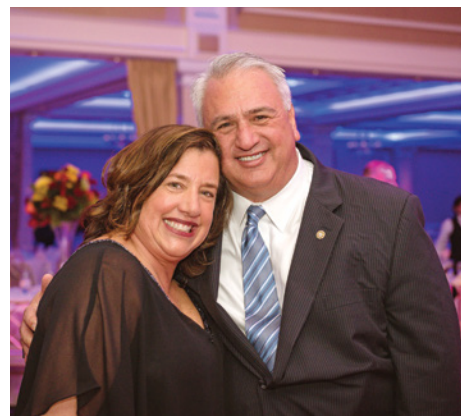
Jason Giordano Photo & Video