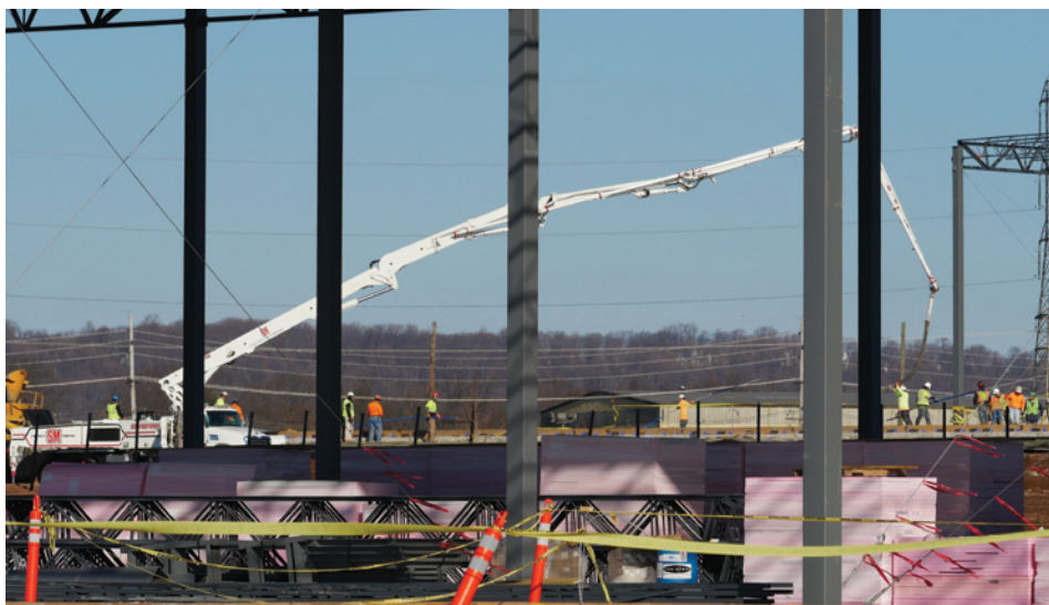
The 32-meter concrete pumper can penetrate hard-to-reach places at a distance.

The class is just one of the many new programs offered at the Training Center in recent months.