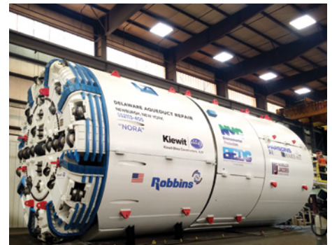
The $30-million drill was built by The Robbins Company of Ohio. It is 42.6 feet long and weighs 1,100 tons.

the city's Department of Environmental Protection will shut down the leaky Delaware Aqueduct in October 2022.