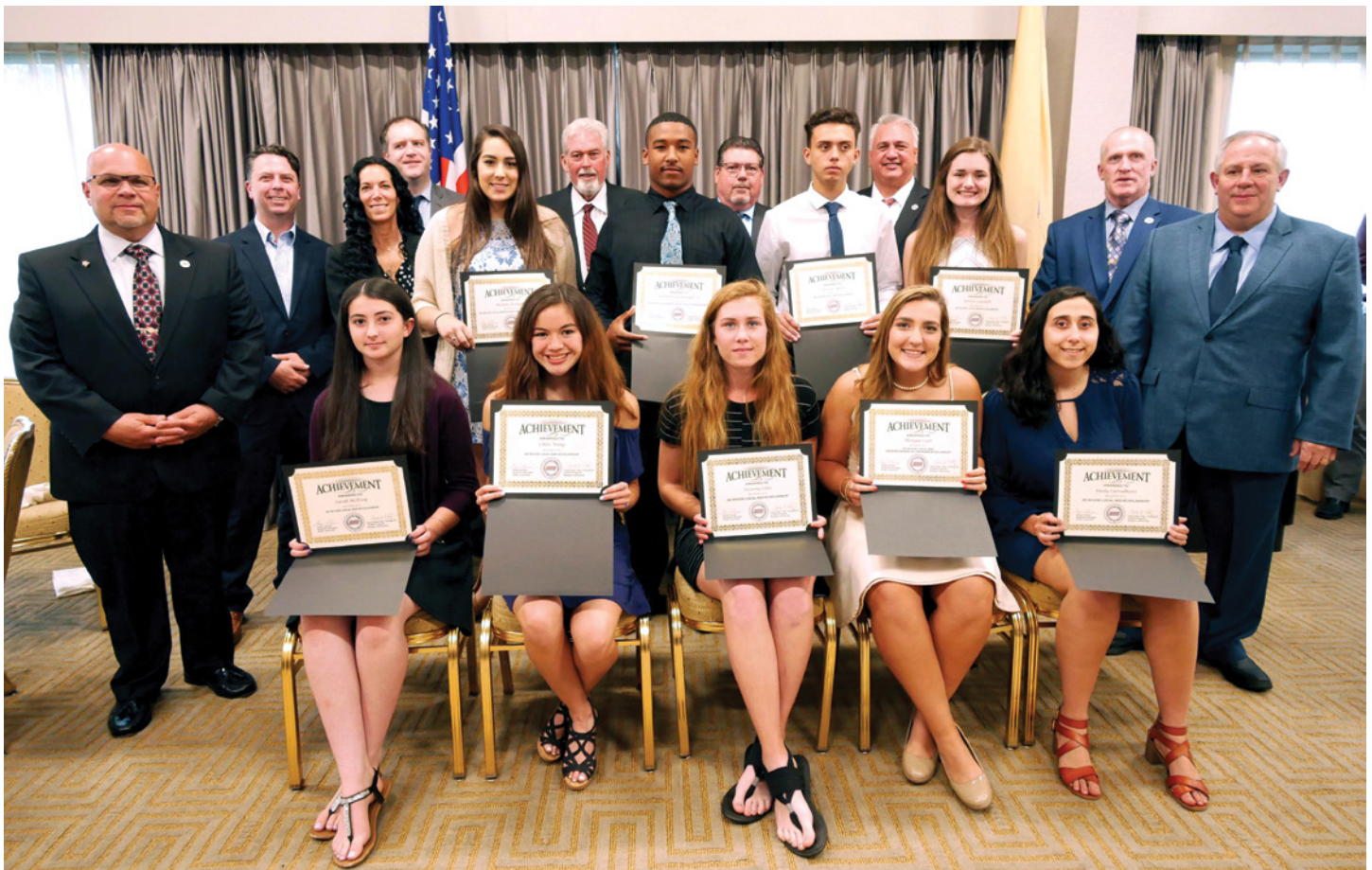
Local 825 and Rutgers University professors toast 2018 scholarship winners and their families.