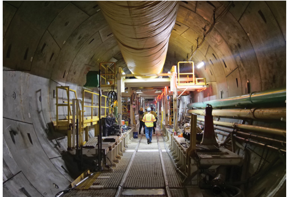
Approaching the drill that progresses between five and six feet each day.

The tunnel walls are reinforced with interlocking steel plates to prevent future leaks from shifting limestone. The floor is lined with rail tracks, allowing miniaturized rail cars to be loaded with debris, hoisted back up through the access shaft to be dumped, then lowered again.