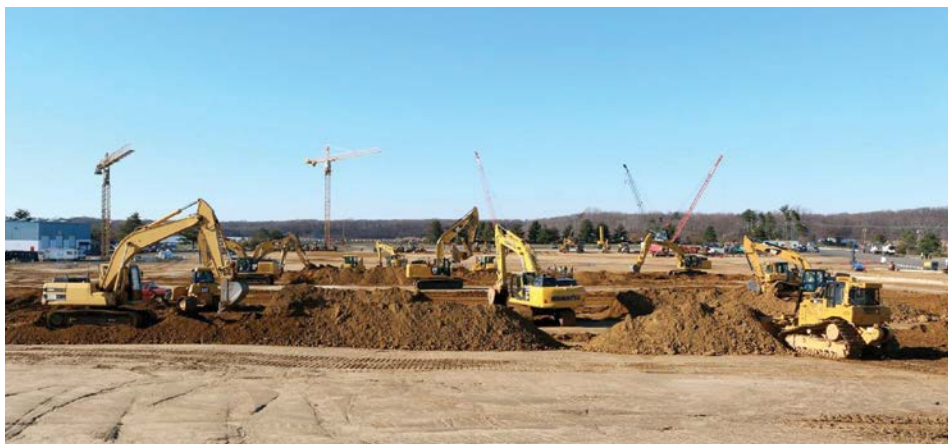
Panorama of 'Dozers & Excavators working in the field.