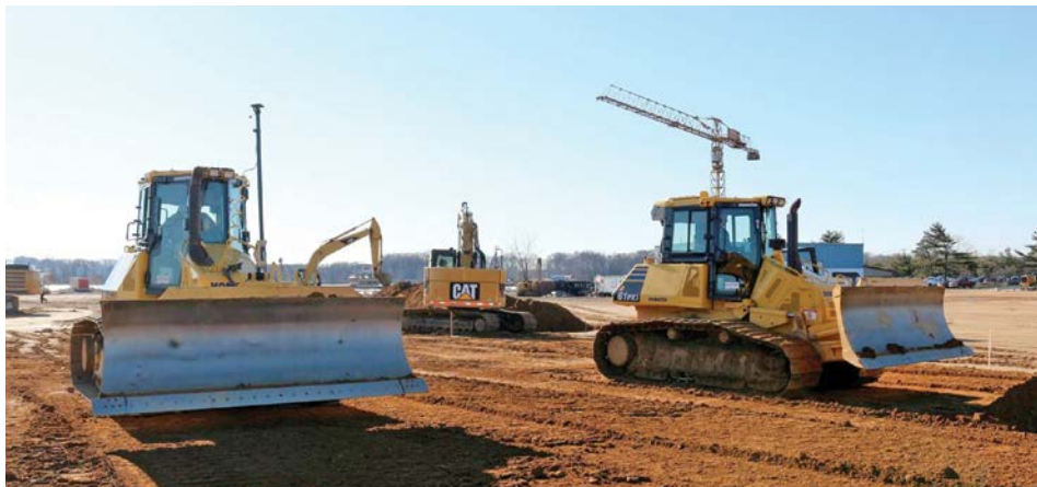
'Dozers in the field running maneuvers in GPS Class / Rover Class.