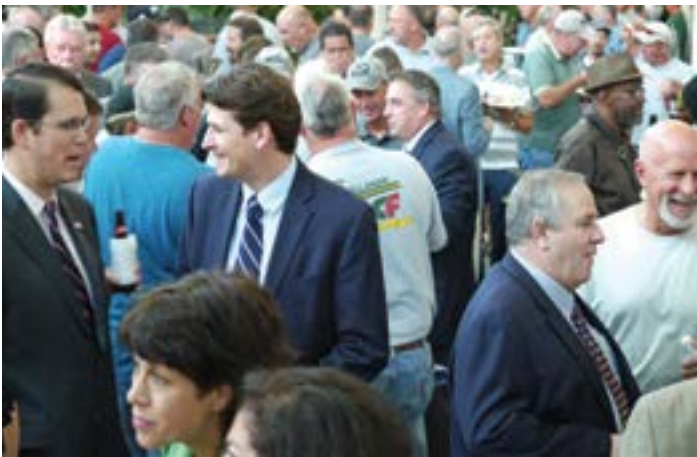
More than 100 candidates came to meet our members face to face.

Coverage of the event appeared in Politickernj.com .