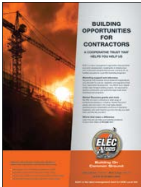
2015 ad targeting contractors