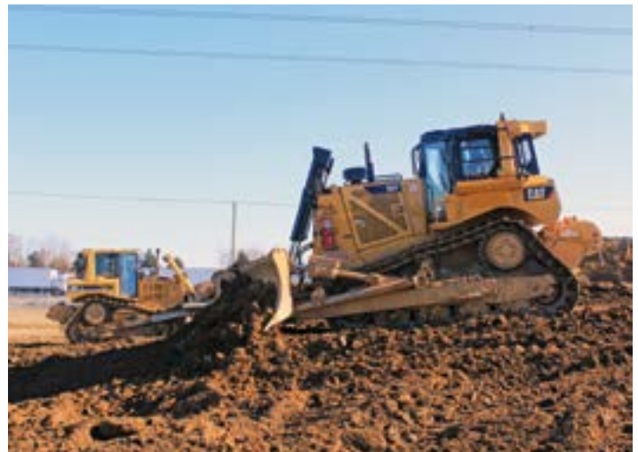
Members participate in the Angle Blade Dozer class, grading off the right of way.