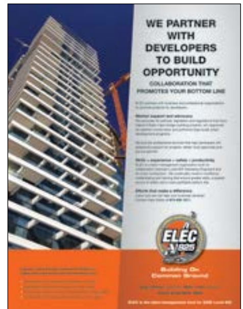
2015 ad targeting developers