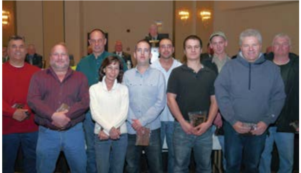
A new class of apprentices also received plaques for completion of their program and becoming journeymen and journeymen.