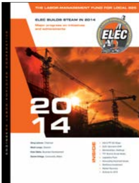
ELEC's 2014 annual review