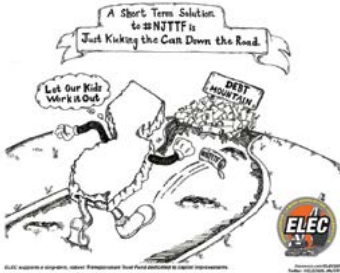
Political cartoons advocate solutions now, not in the next generation

2014 was a pivotal year for ELEC, as we evolved from an introductory phase toward economic opportunity stimulation targeting contractors and developers to create more job opportunities for our members.