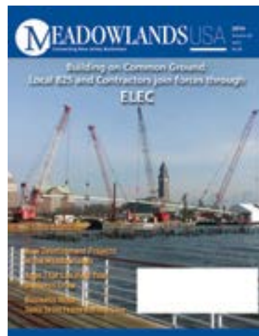
Meadowlands USA carries cover story on ELEC's activities

who are interested in politics, economic development, public policy and infrastructure. Included are politicians, political reporters, and business and trade organizations throughout the state. Our messages are regularly liked, shared, and re-tweeted and our