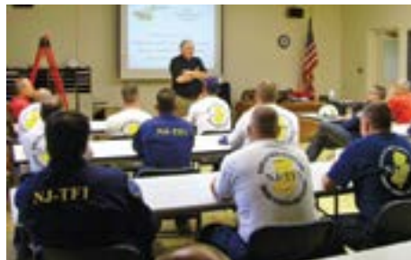
Training Center hosts members of NJ Task Force One

Our new training site in Wawayanda New York also made strides. A new well was installed and passed its PERC test. The building plan was approved and trees were cleared from the building pad area in November. Plans will be put out to bid early in the year, with the hope of a spring groundbreaking.