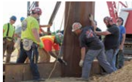
Joint pile-driving training took place twice during the year