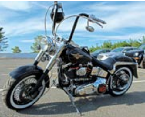
One of our members' vintage bikes at September Poker Run