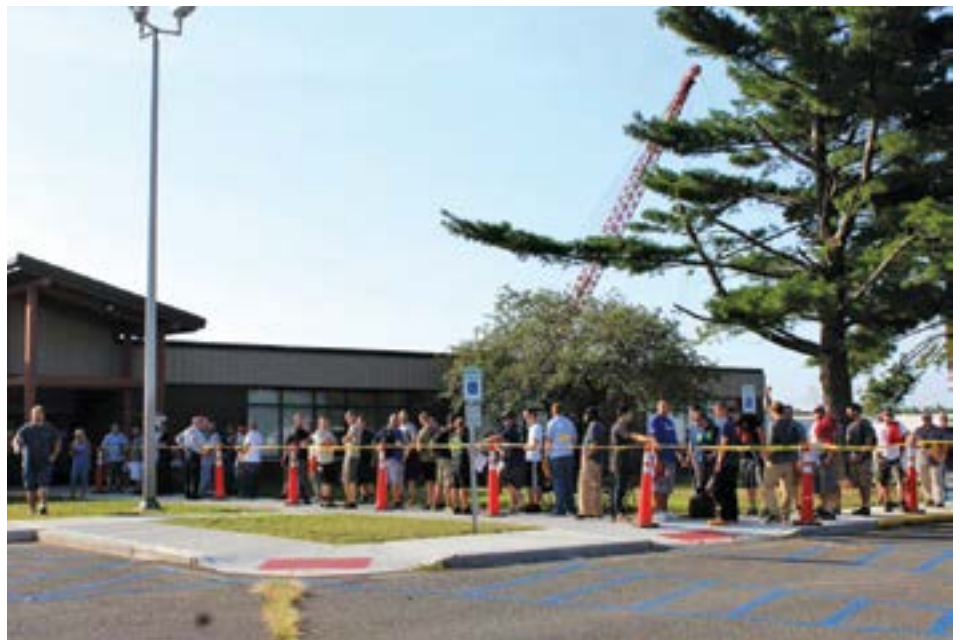
Applicants line the entrance to the Dayton Training Center under sunny skies on Sept. 2

The applicants who are selected will become part of the Spring apprentice program.