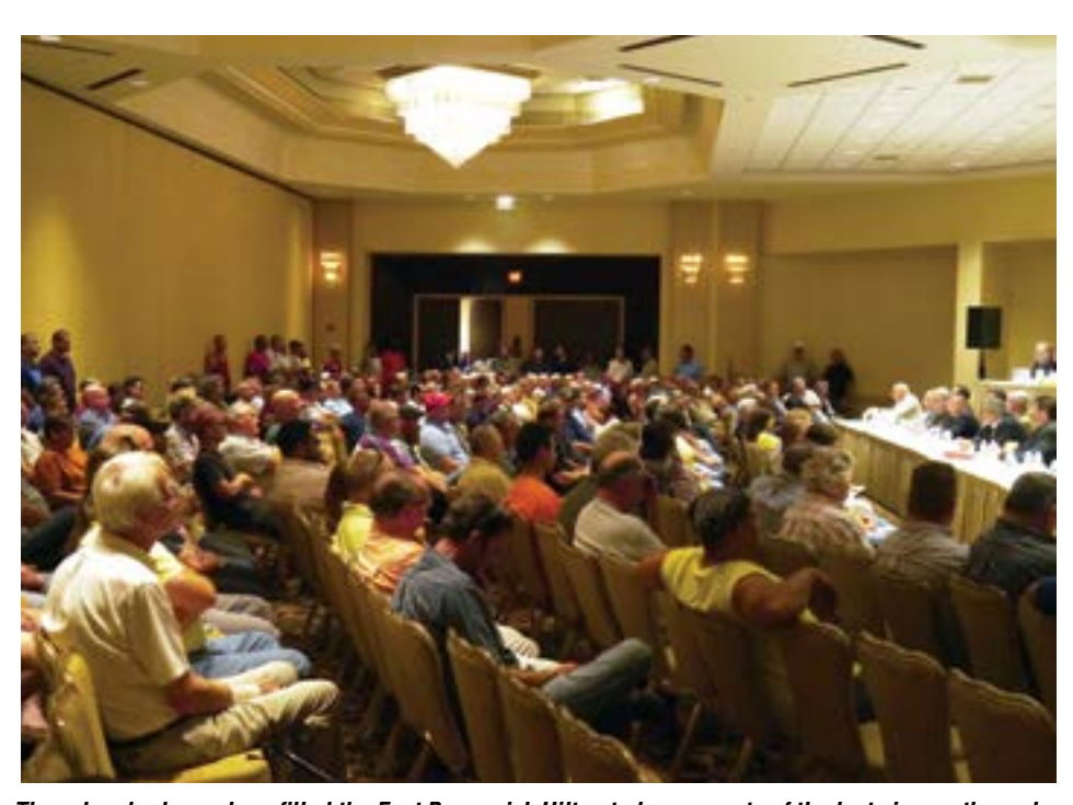
Three hundred members filled the East Brunswick Hilton to hear reports of the last six months and get a glimpse into future months.

There are several large projects on the horizon that would be beneficial to our members.