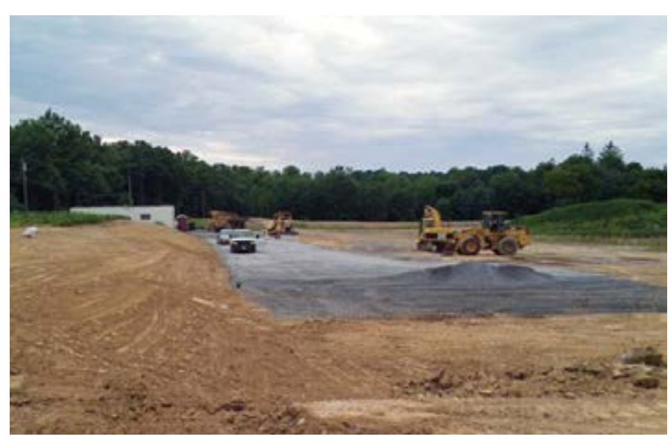
Member volunteers add loads of stone to extend the driveway

Thanks to all the members who have volunteered their time working on the site.