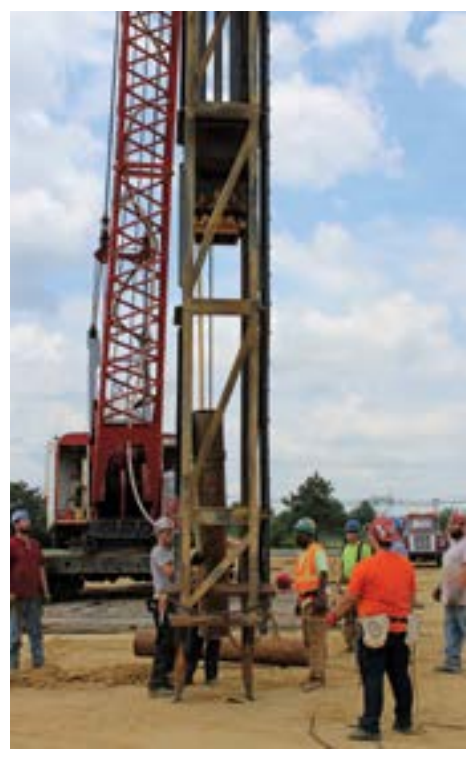
Local 825 instructors drive the lessons home