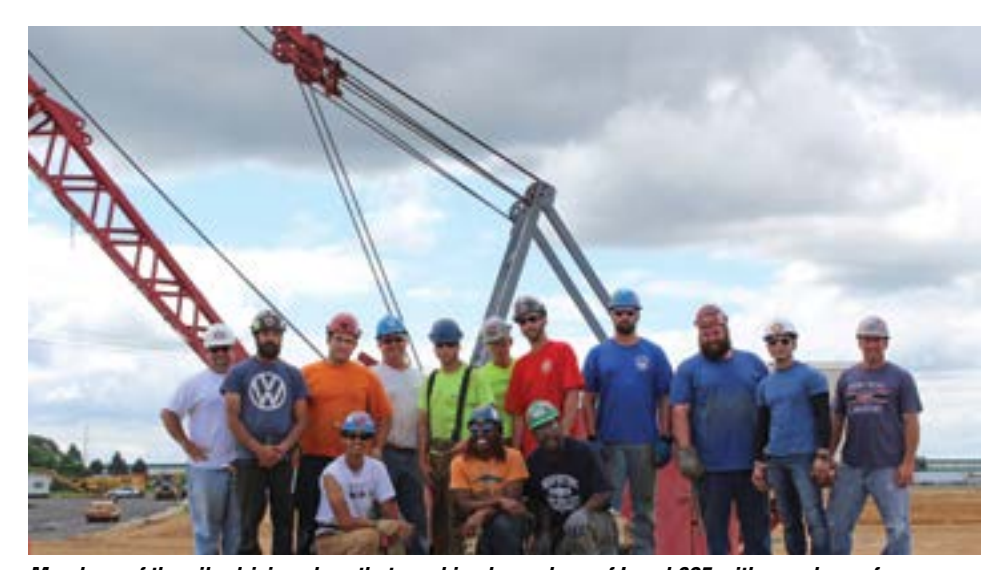
Members of the pile-driving class that combined members of Local 825 with members of Dockbuilders Local 1156 take a break between exercises