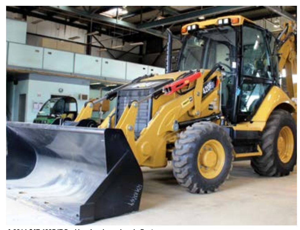
A 2014 CAT 420F IT Backhoe Loader arrives in Dayton