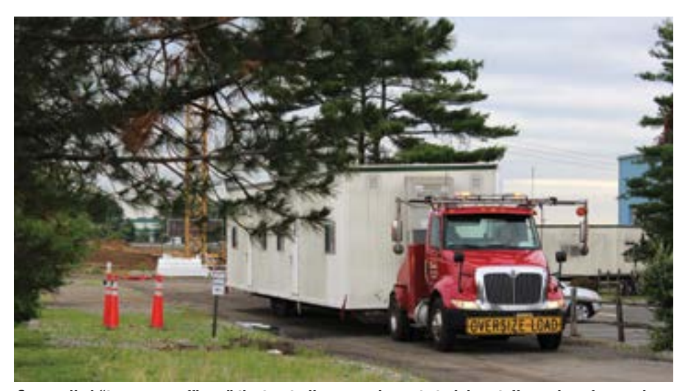
Once called "temporary offices," the two trailers were home to training staff members for nearly 10 years