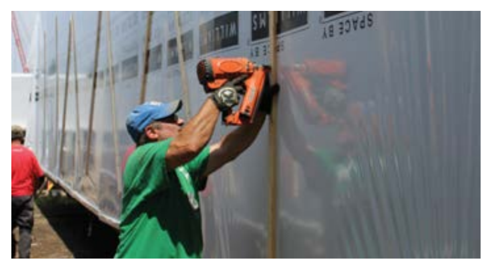
Trailers were broken apart, then prepped and sealed for transport