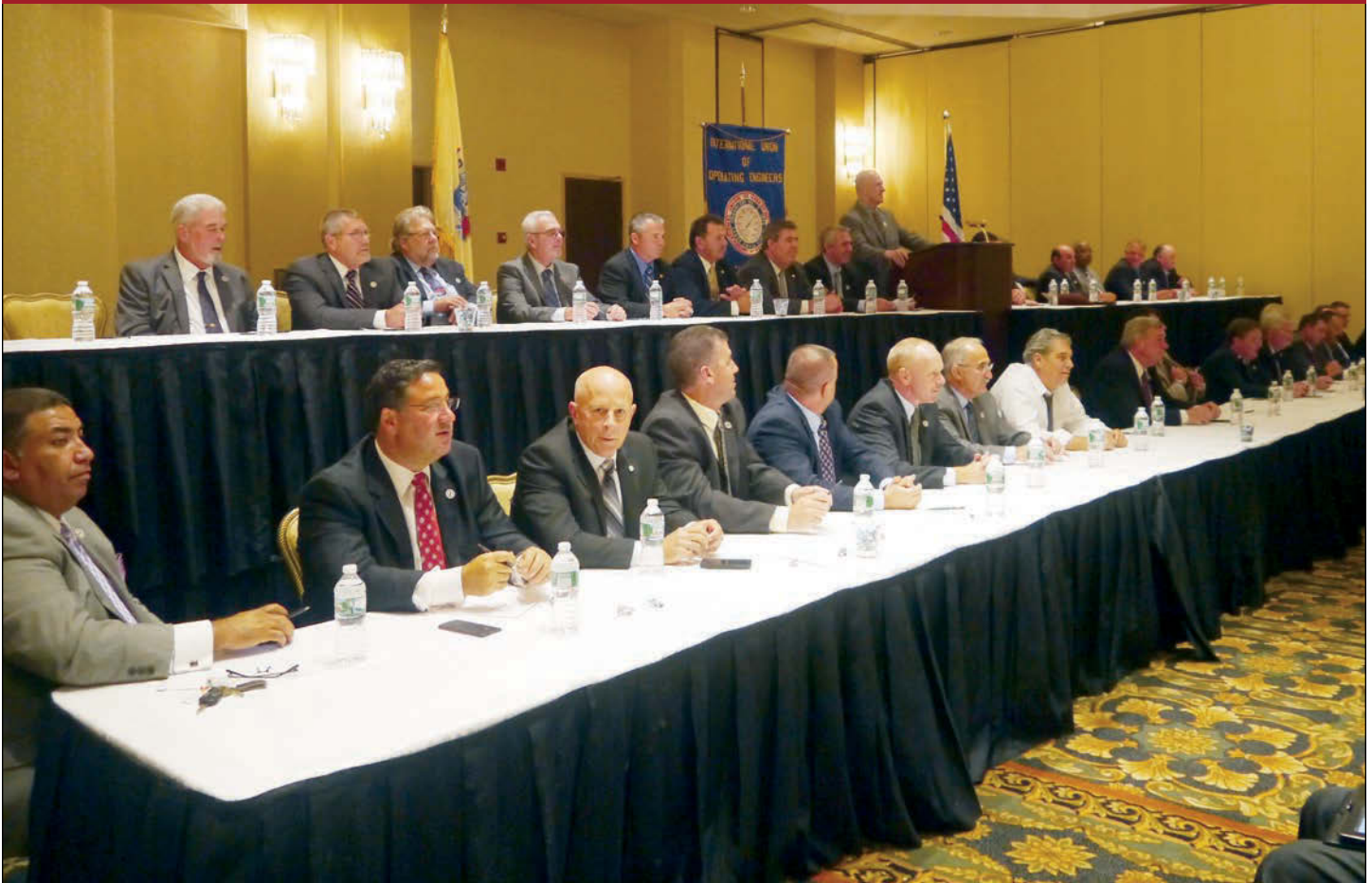
Local 825 members packed the ballroom at the East Brunswick Hilton on September 12 to witness the installation of new officers and take part in the meeting. General

MEMBERS ON HAND FOR INSTALLATION AND RECEPTION