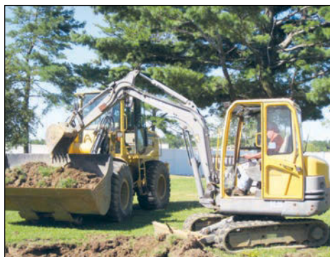
Stripping topsoil, locating utilities, excavating for new footings.

Members who wish to volunteer to help with pre-construction work should contact training staff.