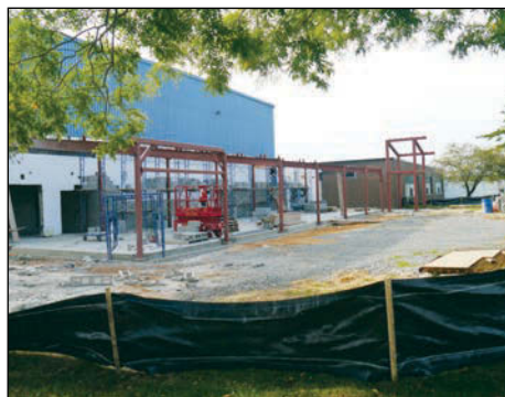
Steel goes up, with the goal of enclosing the new offices before winter.