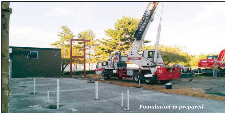
Foundation is prepared.