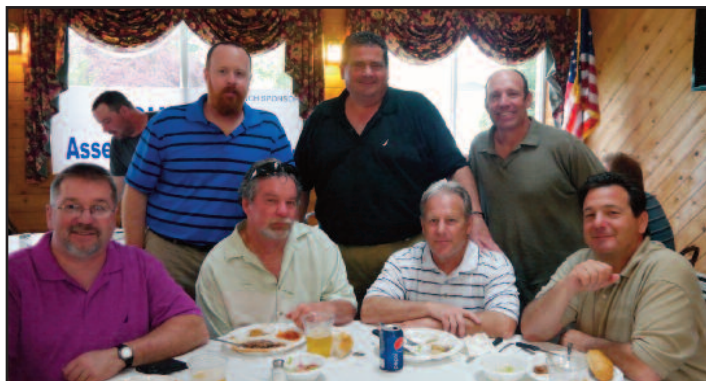
Following the game, participants from all areas joined together for great food and conversation.