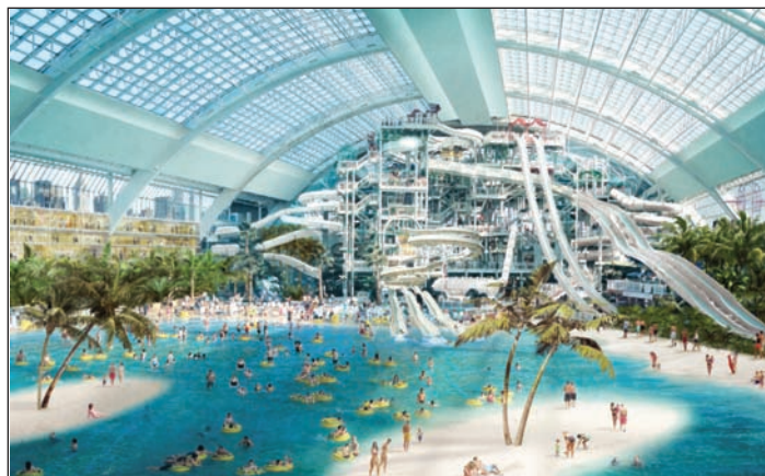
The American Dream will feature an all-year-round indoor water park, among other attractions