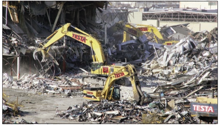
Dismantling the old General Motors plant in Linden, three years ago.