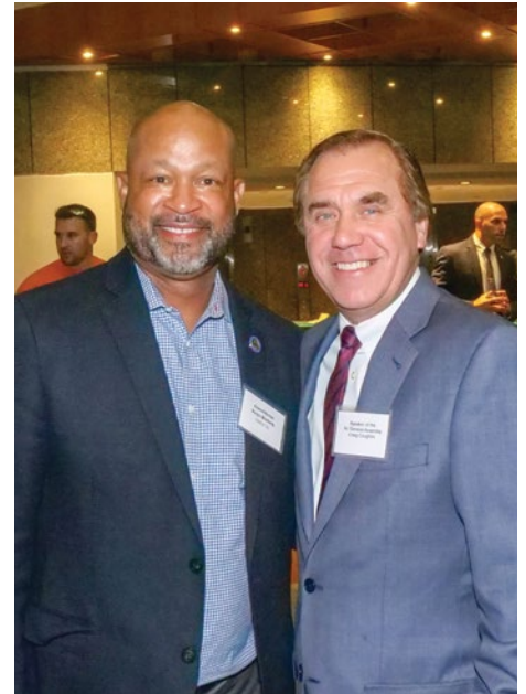
Assemblyman Benjie Wimberly with Assembly Speaker Craig Coughlin.